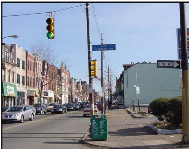
Penn Avenue and South Millvale Avenue

begin a dialogue regarding the community's use of Penn Avenue and related needs and desires. The second meeting will be held in the fall/winter of 2008 and will provide recommendations for physical improvements along Penn Avenue. In addition, there are monthly PACPPC Status Meetings held at the Bloomfield-Garfield Community Center on North Pacific Avenue. These meetings serve to coordinate ongoing planning and engineering tasks with community stakeholders.