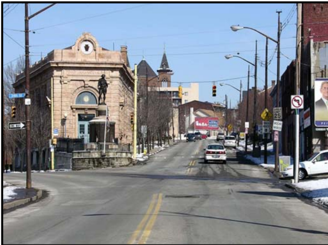
Penn Avenue and 34 th Street (Doughboy Square)

from the Surdna Foundation to create a Penn Avenue Master Plan from Doughboy Square to Penn Circle West. The Master Plan is to include a market study for the corridor, a community vision statement, design guidelines for Penn Avenue, and a development plan with project priorities. This Plan will provide important planning, urban design, community, and real estate development information for the Penn Avenue Corridor Phasing Plan.