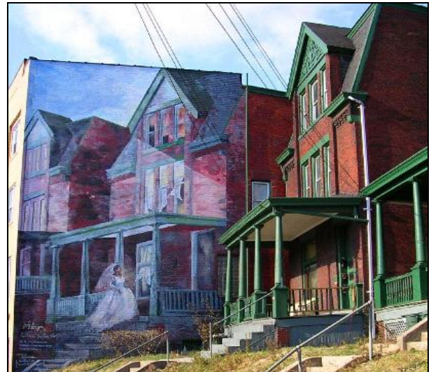
Public Art (The Bride) along Penn Avenue

For more information on this project, please contact: