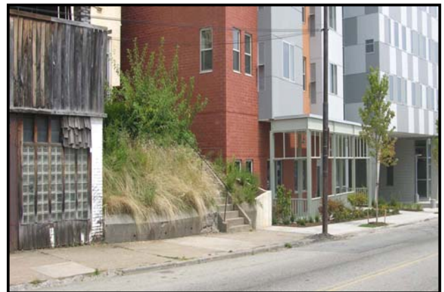
Penn Avenue – Old and New

The PACPPC is an ad hoc group consisting of community representatives from the Bloomfield-Garfield Corporation, Friendship Development Associates, Garfield-Jubilee Association, Friendship Preservation Group, Lawrenceville United, and Lawrenceville Corporation as well as local and state public official representatives.